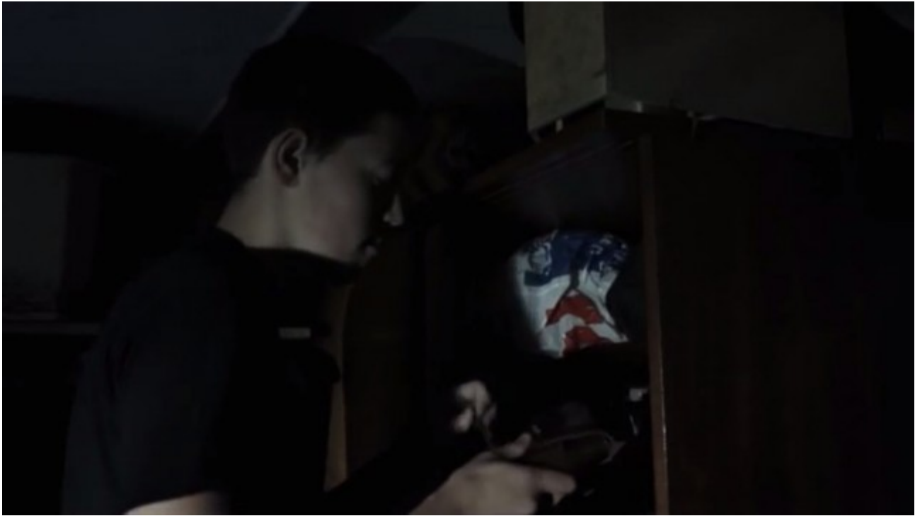
Film still from KOMA: the face is only slightly lit to create a frightening mood.