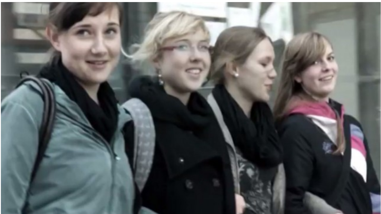
Film still from KOMA: the brightly lit faces emphasise a happy mood.

As with available light, artificial lighting from one side only can make faces appear ,plastic' (see the first image in the chapter).