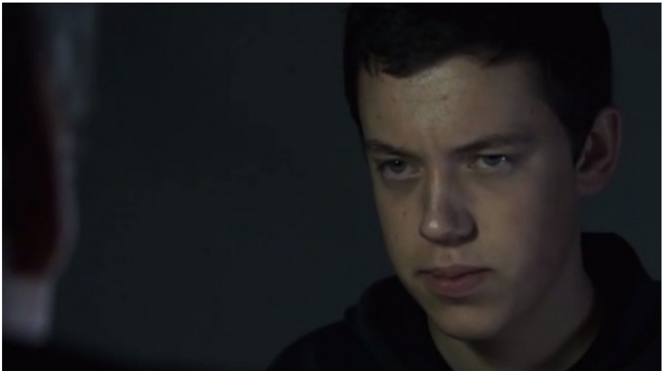
Film still from KOMA: low-key lighting creates a gloomy mood.

In fiction genres, light is usually directed in a way that creates a particular effect or mood. For example, if you illuminate the scene only slightly, you can create tension or a gloomy atmosphere. This is low-key lighting, typical for the 'film noir' and 'neo noir' genres.