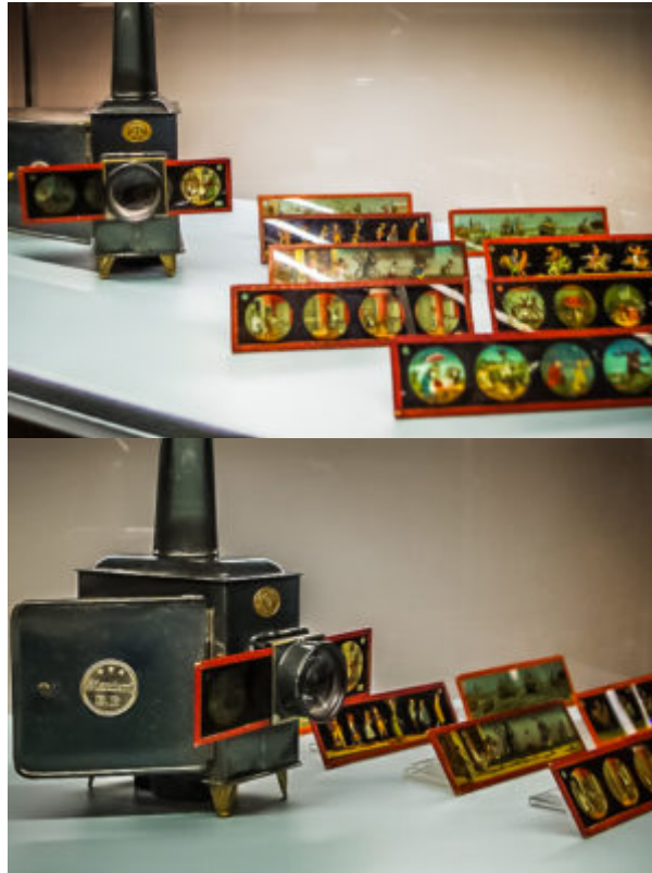
This Magic lantern is kept in Posavski muzej Brežice (SI).

Video: Laterna magica – slides from Posavje Museum Brežice (LIJAmedia) – SI