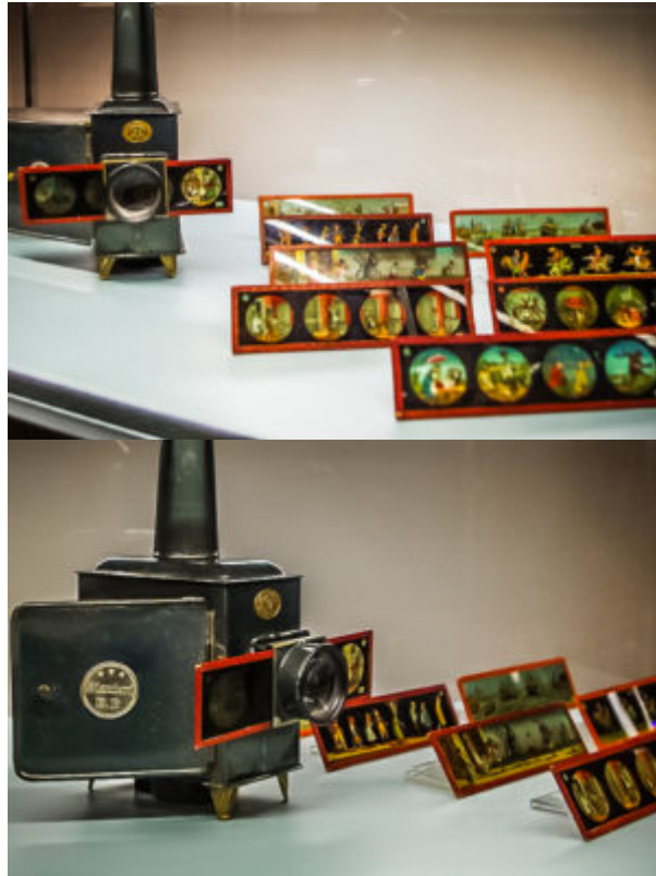
This Magic lantern is kept in Posavski muzej Brežice (SI).

Video: Laterna magica – slides from Posavje Museum Brežice (LJAMedia) – SI