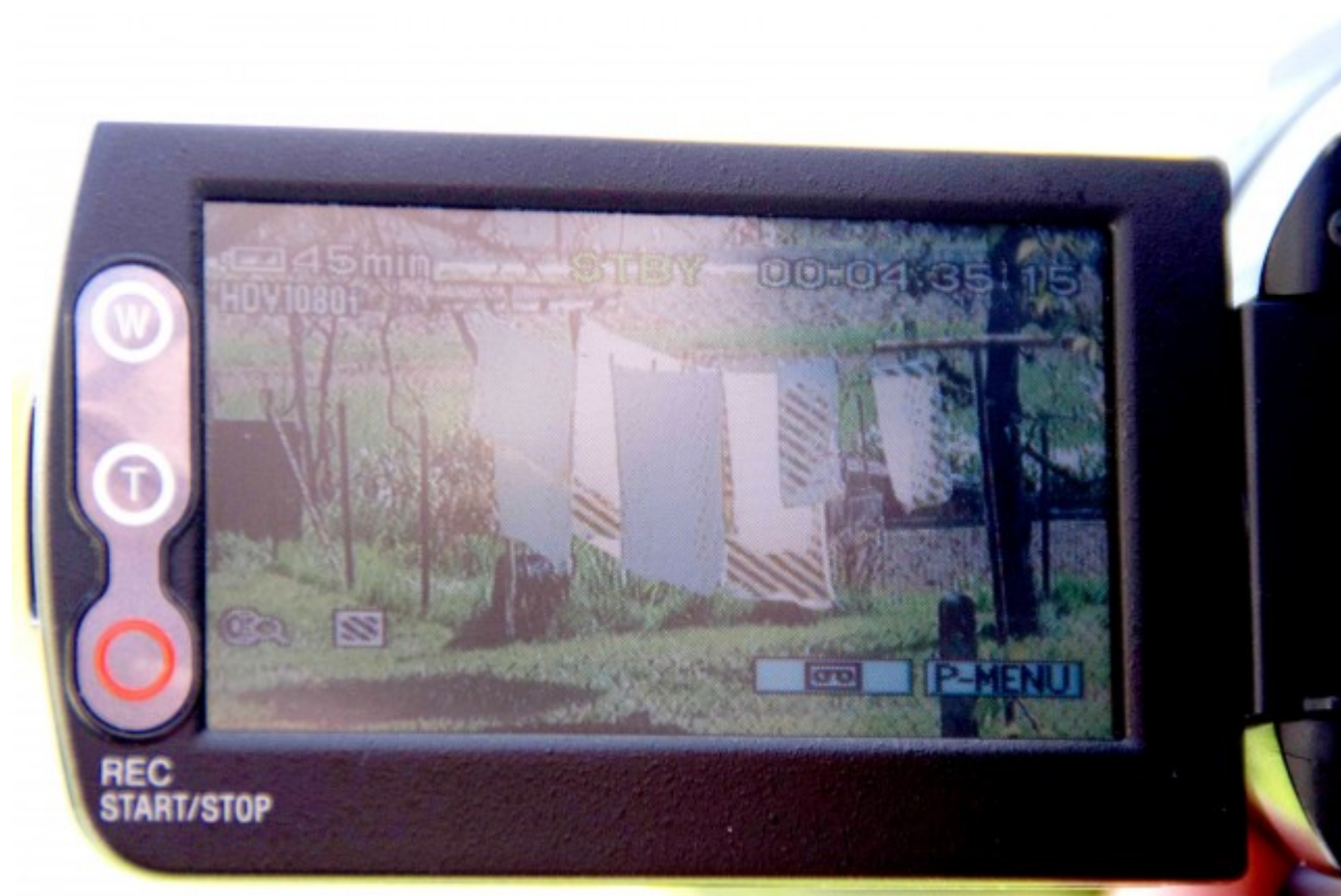
The zebra function marks the brightest spots in the picture

Narrowing the aperture on your camera reduces the amount of light entering the lens as well as the extent of the zebra pattern you see on the display screen.