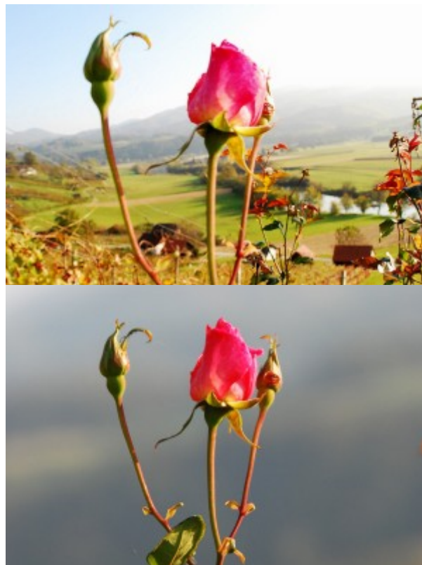
a photo taken with a 18mm lens (zoom-out) and another with the same framing but from a distance and with a 200mm lens (zoom-in). Through the higher focal-length the background appears to be blurry.